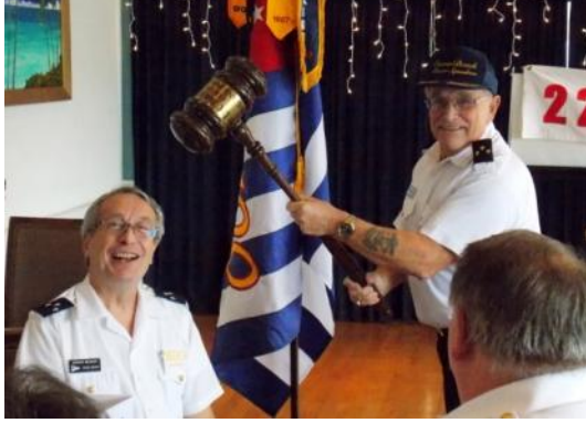
Enters a new management style!