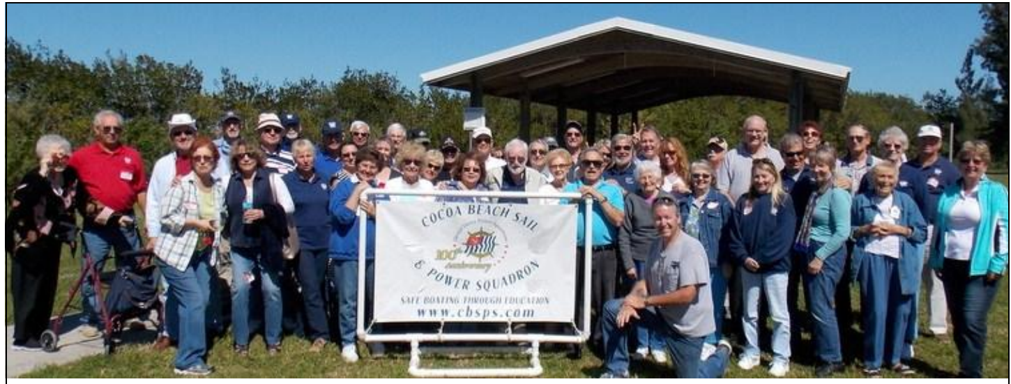
Meet the Bridge picnic on 8 March 2014 at Kiwanis Park was a great success with 62 participants