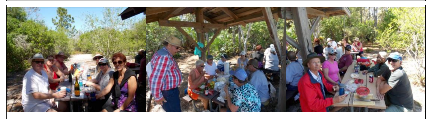
A nice day for the picnic at Samsons Island where a fleet of 6 boats and 22 members celebrated DST